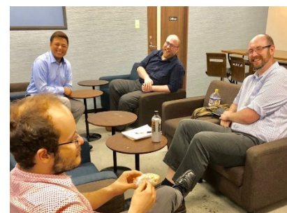
Osaka MM Center break room (Before the Coronavirus outbreak)