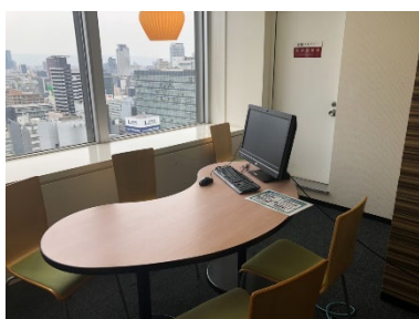
NOVA school classroom (Online lesson room 1)