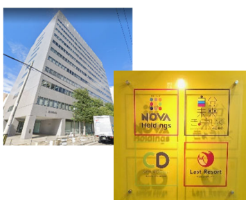
Osaka MM Center (JEI Kyobashi Bldg 7F)