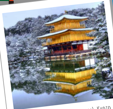
KINKAKUJI (GOLDEN PAVILLION), KYOTO

Breathtaking natural beauty, colorful festivals, incredible warmth and hospitality from local people, amazing efficiency, it's all waiting for you to discover.