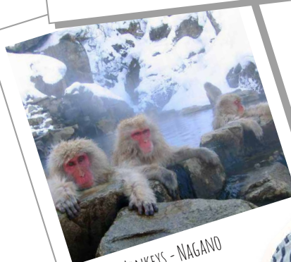
ONSEN MONKEYS - NAGANO