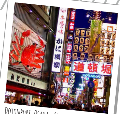
DOTONBORI, OSAKA - 'JAPAN'S KITCHEN'