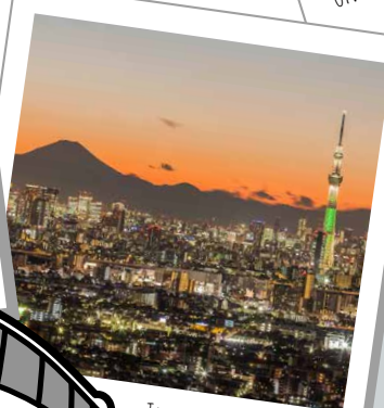
TOKYO SKYTREE AT SUNSET